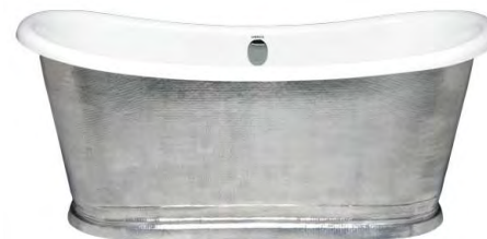
Nickel Hammered Finish Model AMSAWNKH71