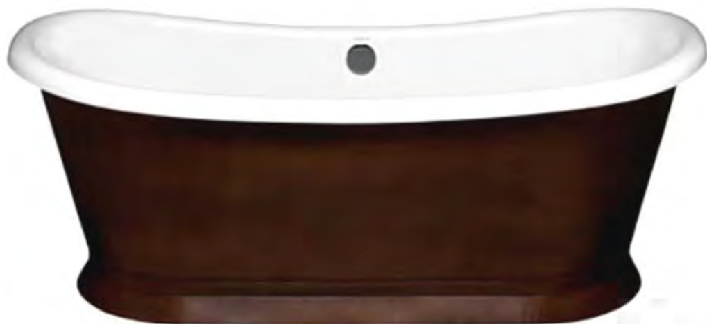
Dark Copper Smooth / Model AMSAWDCS71