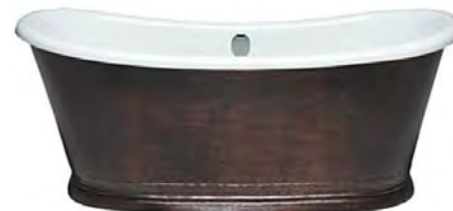
Dark Copper Hammered Finish Model AMSAWDCH71