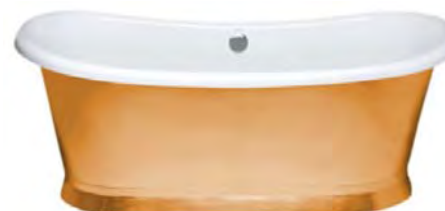
Bright Copper Smooth Finish Model AMSAWBCS71