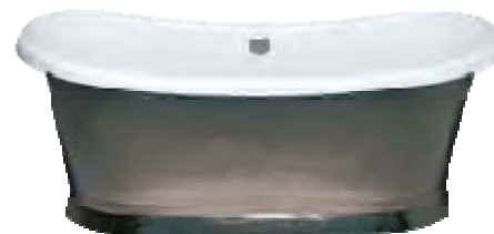
Nickel Smooth Finish Model AMSAWNKS71